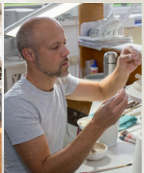
Viennese Porcelain Manufactory Augarten | Sales exhibition | Porcelainpainter